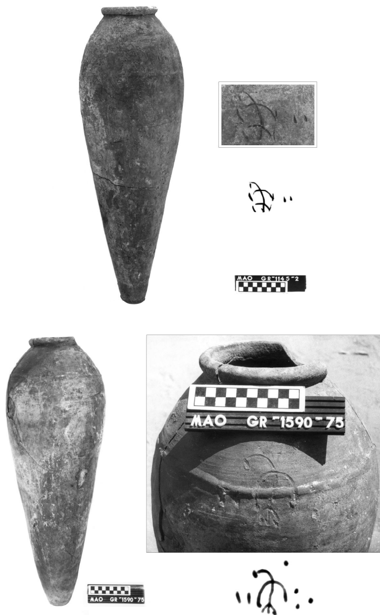
Fig. 3: 1. Minshat Abu Omar. Grave 1145/2; 2a. Minshat Abu Omar. Grave 1590/75.