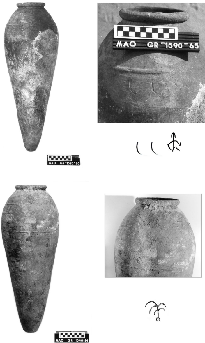
Fig. 4: 2b. Minshat Abu Omar. Grave 1590/65; 3. Minshat Abu Omar. Grave 1040/14.