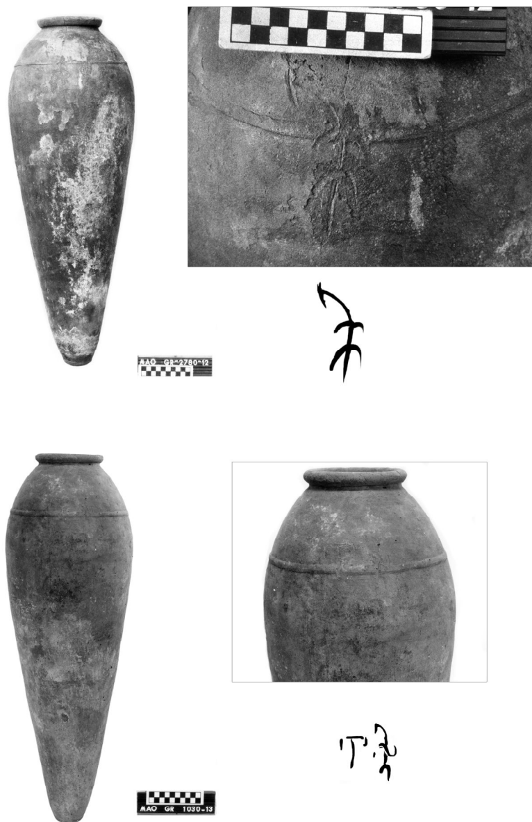
Fig. 5: 4. Minshat Abu Omar. Grave 2780/12; 5. Minshat Abu Omar. Grave 1030/13.